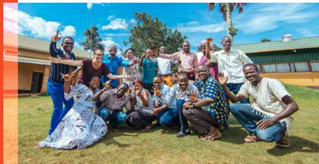
Members of the Invisible Children DRC Team